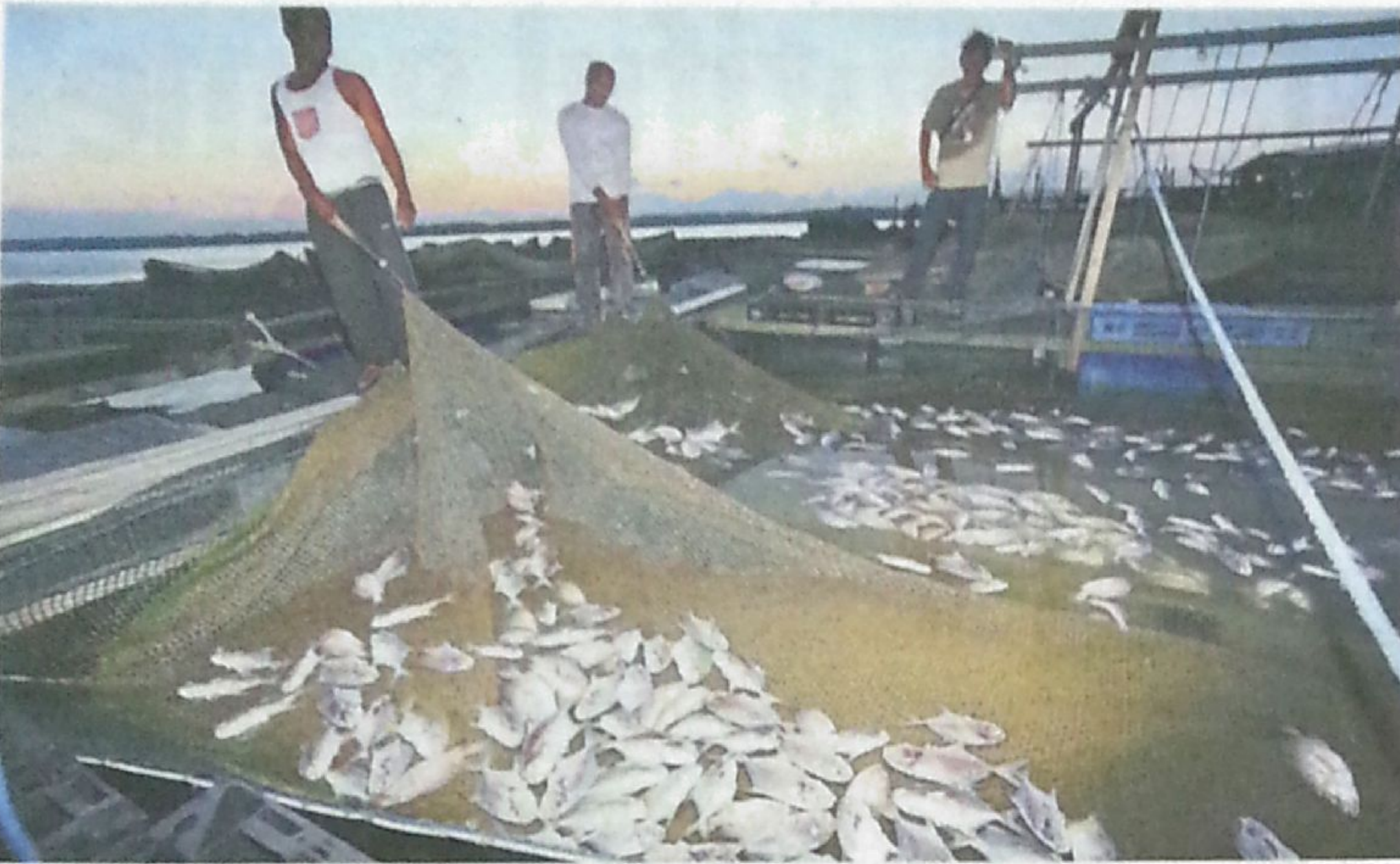
Major loss: Workers showing the dead fish at a kelong off Pasir Ris beach.