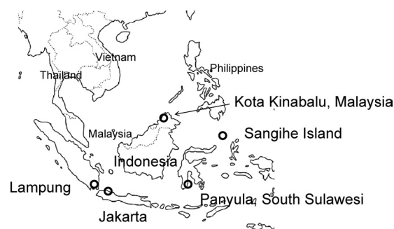
Fig. 2. Sampling areas in Indonesia and Kota Kinabalu, Malaysia.